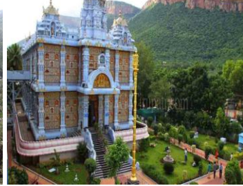
6. Isckon temple-65kms