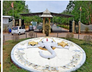
3. SV zoo park-65kms