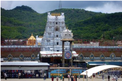
1. Tirumala Temple-65kms