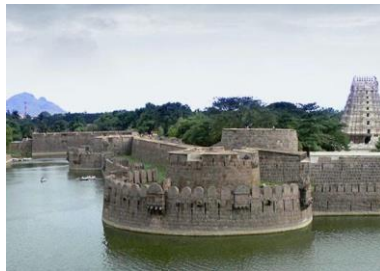
6. Vellore fort-35kms