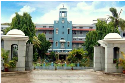
7. CMC, Vellore-35kms