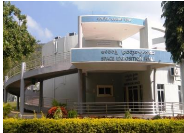
2. Science centre-65kms