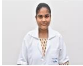
S SANA AFREE