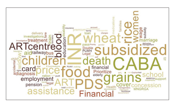
Figure 3: Qualitative analysis of the major provisions in the social security schemes for the PLWH in India, 2019.

have shown that India has a unique approach to addressing the social issues faced by the PLWH through various schemes run by the government. We have summarized the type of schemes, beneficiaries, and their entitlements in various states with a high HIV burden. Our finding also indicates the variation in the